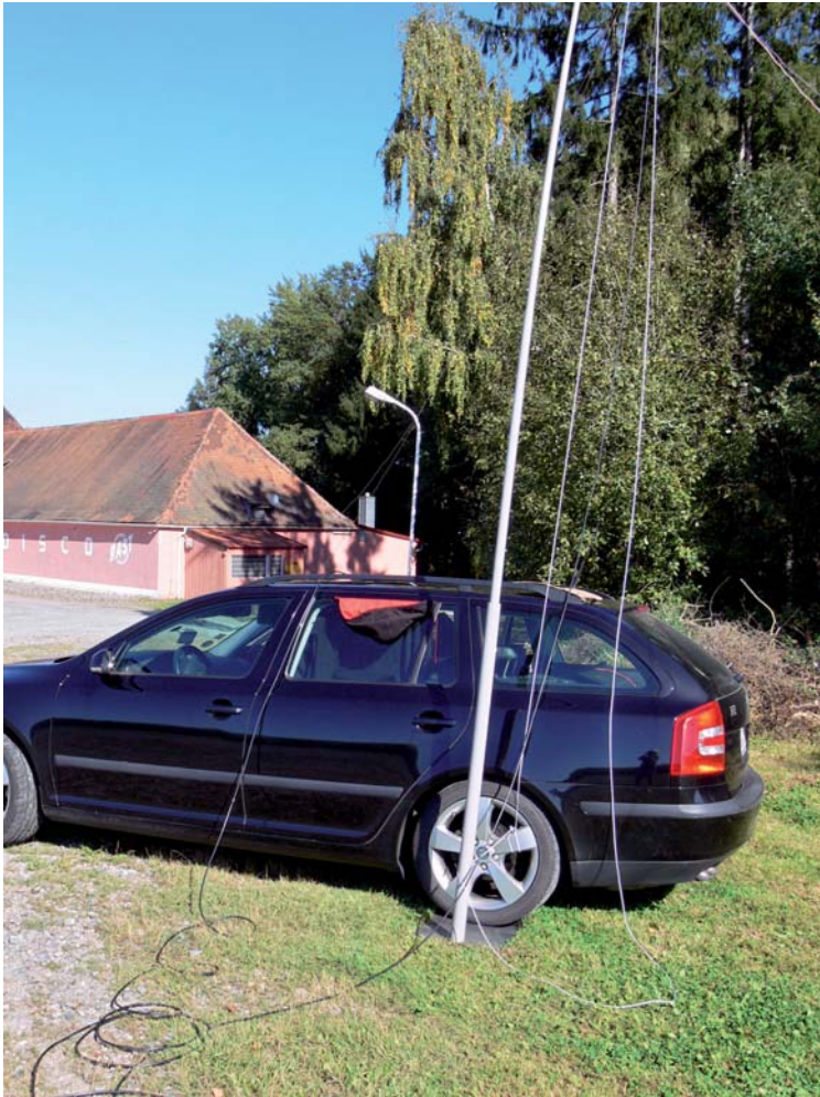
saw very late that a tube was missed so not too straight today

with double-dipole, battery-powered. When unmounting everything, I still saw that I had forgotten to include into my mast-construction the stabilizing tube at the lower-end because it was standing not so straight as usual but anyway, luckily there was no problem during the operation and of course also sunny weather, no wind, a day again like summer. On the return-way home we checked the local conditions there at the castle of Niedermurach. So I was too tired to build up anything again and also the location there doesn't allow to set up the mast-construction. So this will be definitely a mobile-antenna-only-operation. So the plan is, for next-years season to activate the two castles of Niedermurach and Wernberg the same day because they are very close together. Both of them are located in DLFF-098 and of course also interesting for WFF-hunters again. So this was finally my portable operation number 16 in the season 2011, 6 of them large-scale-operations together with my colleagues. Since 2010 meanwhile 10500 contacts were made under the callsigns DAOCW and OK8WFF. All contacts were confirmed via bureau and EW4DX-database. Also the cards for this operation are already in the buro und should reach you in the next months.