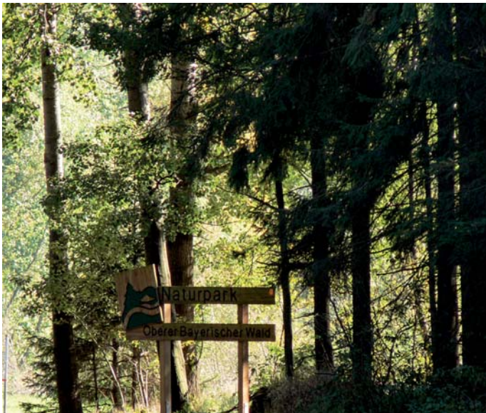
welcome in the park-area

first it was not exactly clear what will be the destination. When we were in august active from castle Reichenstein, we viewed also for a location to activate the castle of Wernberg. However this castle has actually no WCA-number and the chance, to get it so short-termed would be very small. So we finally decided to do again a WFF-only operation this time in the area bavarian wood. In last years first activation from DLFF-097 together with DC2RK and DK4RM we made 597 contacts from there. So meanwhile there was no local activity from the park-area and for sure again a high demand. So I started with my xyl around 0930 UTC. From the previous activation the area was well-known and some possible locations were in my assortment but then, directly beside the main-road „Ostmarkstrasse“ which is going through the complete bavaria wood, I re-