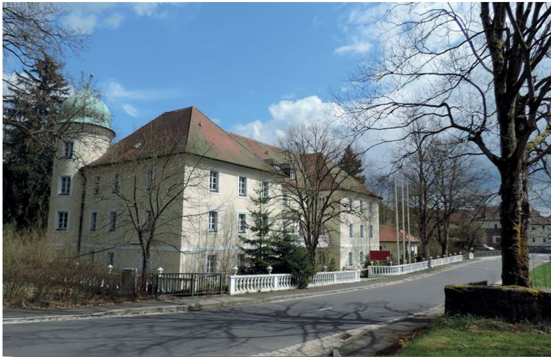
Castle Trevesenhammer, in the 90ths built to a first class hotel and meanwhile empty

01. of may, castle-day. Meanwhile the 14th time were the middle-german-castle day happened and the 4th time were COTA-team-germany invites to the german castle day, not a contest, just an activity day to bring a lot of castles on the bands and enjoy portable-activities. Last year we spent the castle-day in Naturepark Altmühltal however 2015 the weather-forecast was terrible so we decided to remain in the