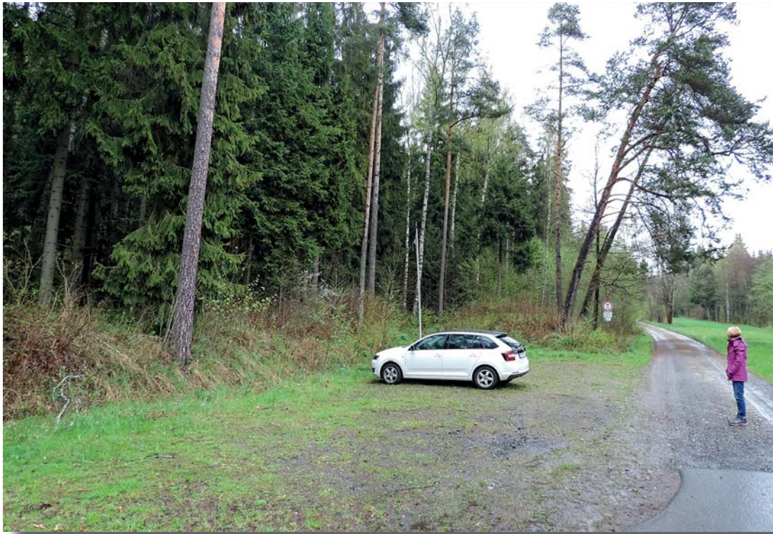
Preparing for dismantling during a little rain-break

there it was much easier to get a good frequency. When on 40 meters tried also several times the frequencies under 7.100 to give also those a chance which licence doesn't allow to transmit above 7.1. Last band-change was again to 20 meters were several UA/UR/EA made it into the log. Last QSO was with UA-6GE on 40 meters CW. The total score was not overwhelming with 172 contacts, but under that conditions also not bad.