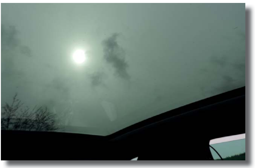
sometimes sky appeared very unfriendly but no more rain

Weather was quite windy meanwhile and we were high located but the best thing was no more rain. So after the quick setup we started at 1205 UTC back on 40 meters, we used this time our club-callsign DAØCW/p and the first station which replied was IK1GPG. The austri-