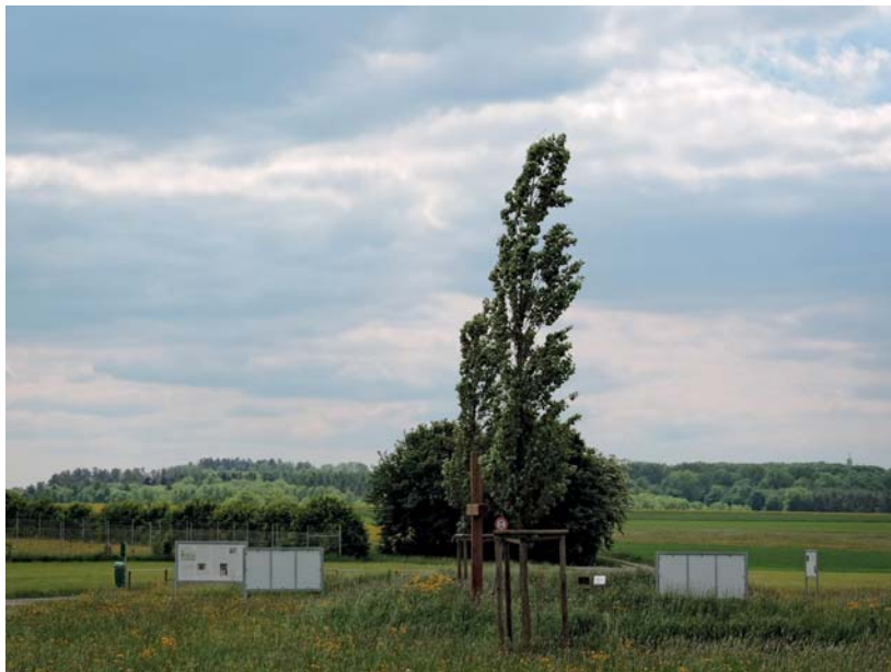
very windy but dry

When arriving at the area, we found out, that since our last visit, most of the small ways leading through the area are meanwhile closed, so access is only available on the small outer surrounding road. Temperature was at the begin just 13 degrees, later growing up to 16 and a heavy wind was blowing continuously. Just after building up the antenna, we got a short visit from the park-ranger and after declaring him our intention, we could continue.