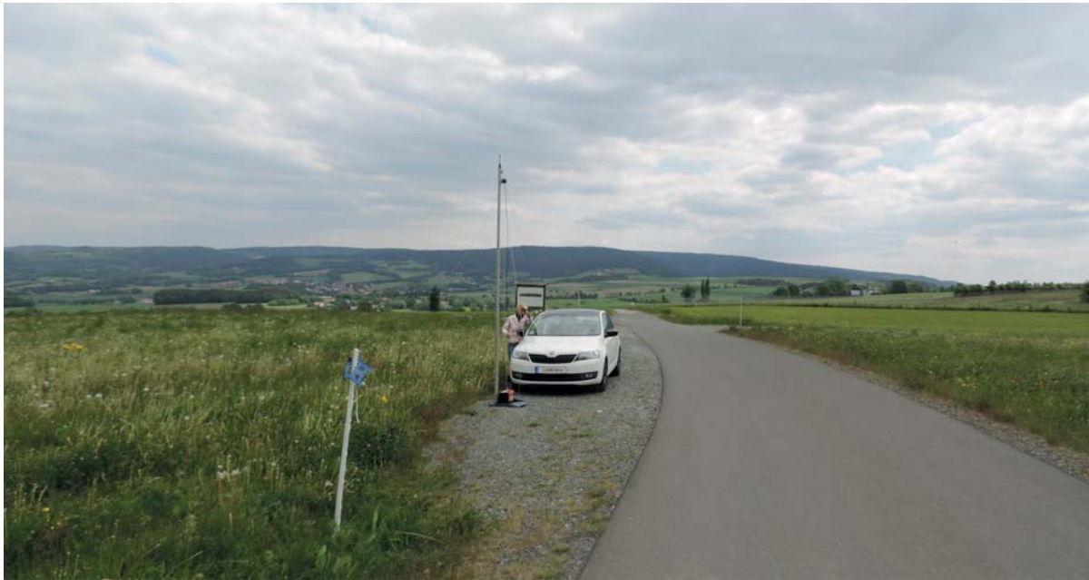
only remaining small road where access via car is possible with Fichtelgebirge behind

tacts could be done. Anyway the later morning was not so effective as for sure a lot of people were out for shopping for the coming longer whitsun-week-end. Statistic showed 33 percent of the contacts with germany, 13,8 percent with italy and 13,2 percent with poland. Altogether 30