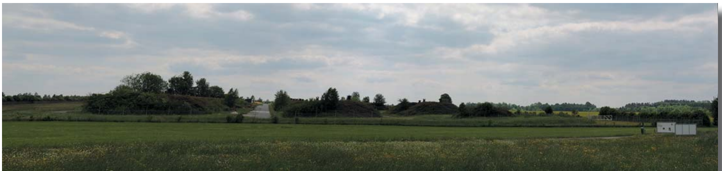
surrounding view into the area