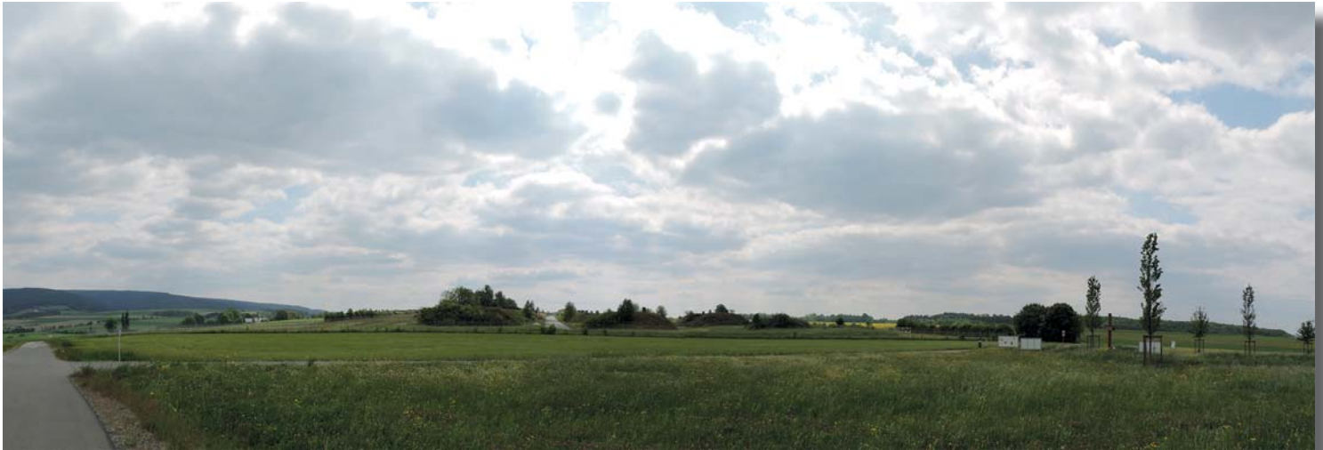
in earlier years it was used as military base, since 2007 everything has left the remaining former ammunition bunkers overgrown

In april 2013 we made the first activation from this area. Wondered a bit that two years later was no further activity from here as the area is only 5 minutes away from one of the biggest fasttrack in germany A9 Berlin-Munich. So thought it will be time that this nice place will reappear on the bands as for sure lot of new hunters will need it.