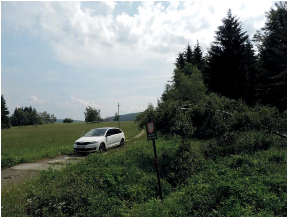
nature-park shield and only entry with a car

In the first years when you are married, you normally present your xyl probably some kind of jewelry, invite her for a special-dinner and of course flowers. This year I planned some special gift for her on our wedding-day. The activation from a new WWFF. I cannot describe how lucky she was :-)