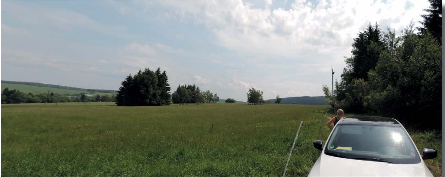
view into the meadows on the border-area of OKFF-0722, left in the background the small village Mnichow

Mokradý Pod Vlčkem is a protected-area issued in 1995 with a size of 40 ha and located at abt 760 meters asl into the nature-park slavkovsky les OKFF-0006. It consists by a mix of grass-meadows, wetland and wood with several ponds inside and some gas-discharges along them. Distance to the well-known town Mariánské Lázně is about 10 km.